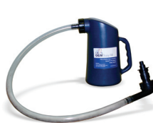
Easy Fill Battery Filler